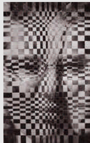
Gallery on the Plaza