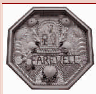
Gallery on the Plaza