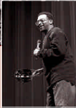
Award-winning filmmaker Spike Lee was the key note speaker.

In celebration of Black History Month in February, the UConn Libraries featured related library and archival resources including books, films, research guides, and Web sites: http://www.lib.uconn.edu/using/Diversity/Black_History.htm