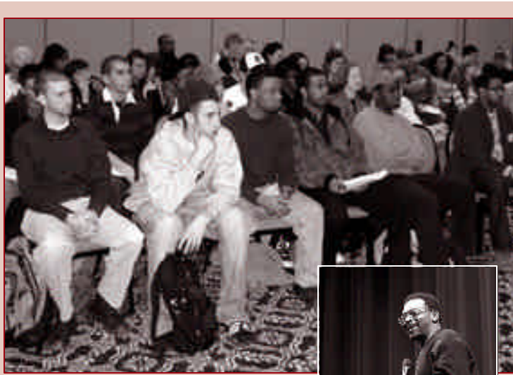
Audience members listen to a panel discussion at the Harlem Renaissance conference.

The major will help the University establish strategic partnerships with other institutions in Connecticut and the nation, and will complement course work already offered in Asian American studies, human rights, Puerto Rican and Latino studies, and women's studies.