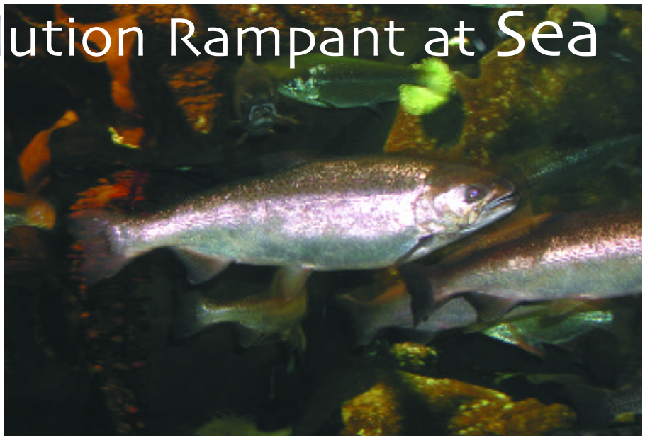
Because larger fish are more likely to be retained in fishing nets, reduction in average adult fish size has occurred over time in finfish like this Pacific salmon, as a result of selection against fast-growing individuals.

Most examples of rapid evolution are from land studies. But aquatic scientists are quickly realizing that rapid evolution is also rampant at sea. For instance, selective removal of large fish in commercial fisheries has led to