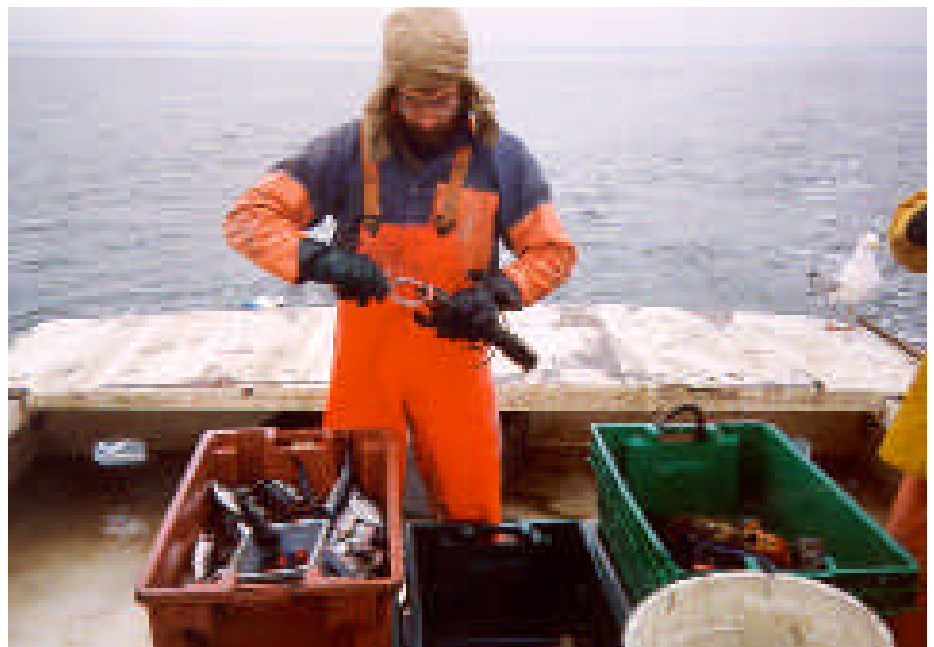
During trawl surveys by the Connecticut Department of Environmental Protection, characteristics and measurements of lobsters caught are recorded in order to assess the population dynamics.