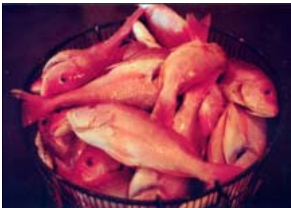
Red snapper is a popular catch for commercial and recreational fishermen alike. Management shortcomings have led to frustrations among many red snapper fishers.

concepts, and would place more management authority in the hands of recreational anglers—allowing anglers the authority to devise management measures most appropriate for their local regions and the species they target.