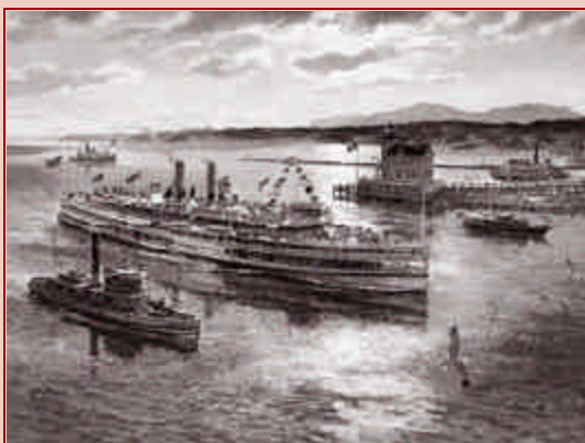
The Alexander Hamilton