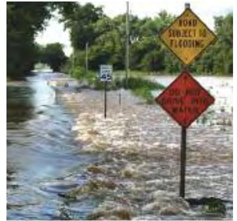
Coastal flooding is becoming more frequent as sea level rises and precipitation and consequent storm runoff increase, leaving towns and municipalities hefty bills for repairs.

The horizontal distance that the water moves inland when it rises vertically depends on local topography. If the land is flat, a small rise in water height can go quite far inland; if the land is steep, such as a rocky cliff, obviously that's a different story. There are many