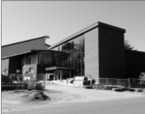
THE INTRAMURAL RECREATIONAL AND INTERCOLLEGIATE FACILITIES PROJECT UNDER CONSTRUCTION.

Financial Services Corporation using a capital lease structure with an average interest rate of 4.5%. Cost-avoidance achieved through the construction of the facility will generate funds to pay the debt and debt service. Construction manager for the building portion of the project is O & G Industries of Torrington, CT, under contract with Select Energy, and the Project Manager is Dahlen, Berg & Co. of Minneapolis, MN.