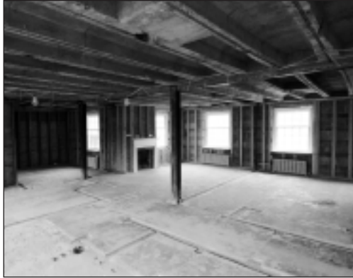
AN INTERIOR VIEW OF THE LAKESIDE APARTMENTS, WITH CONSTRUCTION SET TO BEGIN.