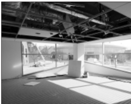
THE STUDENT UNION BOARDROOM, LEFT, AND STUDENT UNION FOOD COURT, RIGHT, UNDER CONSTRUCTION.