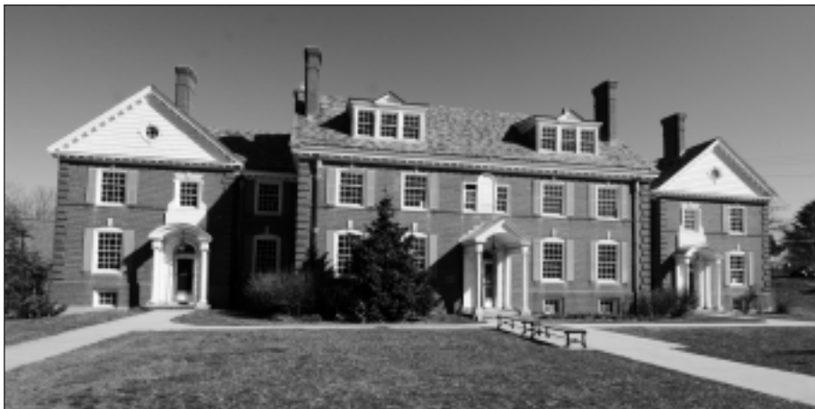
DESIGN FOR THE RENOVATIONS OF THE FORMER LAKESIDE APARTMENTS HAS BEEN COMPLETED.