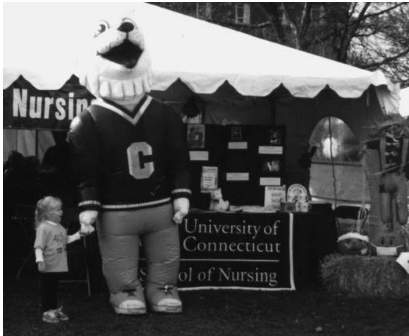
Big Blue visits the tent as alums, families, and friends eat lunch.